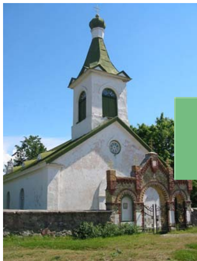
Church of Kihnu, Photo: Siim Sepp, 2003

Registrations for workshops will be accepted on a first-paid basis. When a class is filled to capacity, we will start a waiting list. If you are wait-listed for a class, we will return your check to you and ask you to send a new check if a space opens up in the class. There will be no refunds unless we can fill your place from the waiting list.